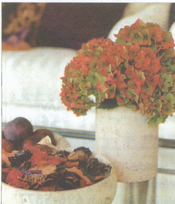
Bowls and a vase of travertine marble are souvenirs of a trip to Italy in 1988.